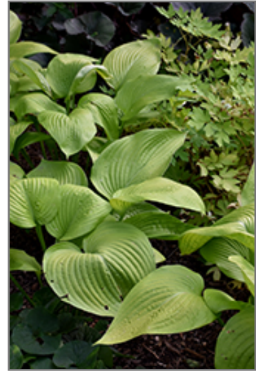
Key West Hosta

This plant does best in partial shade to shade. It prefers to grow in average to moist conditions, and shouldn't be allowed to dry out. It is not particular as to soil type or pH. It is somewhat tolerant of urban pollution. This particular variety is an interspecific hybrid. It can be propagated by division; however, as a cultivated variety, be aware that it may be subject to certain restrictions or prohibitions on propagation.