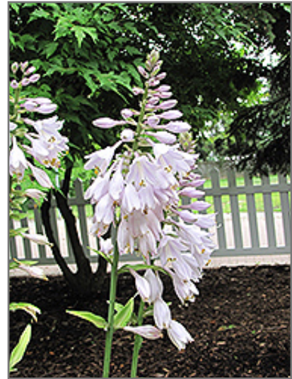
Key West Hosta flowers