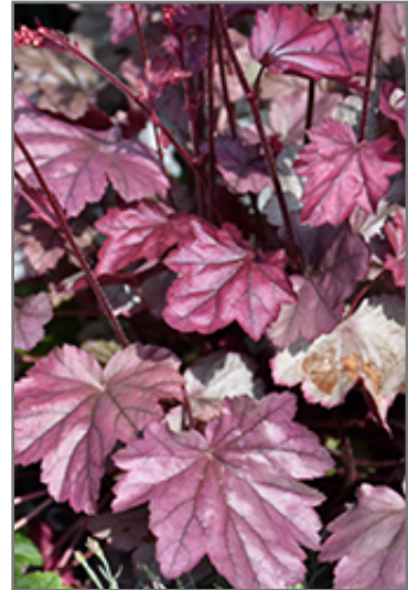
Stainless Steel Coral Bells foliage