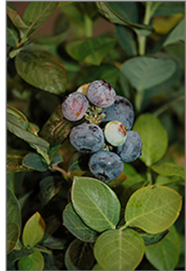
Peach Sorbet Blueberry fruit

Peach Sorbet Blueberry features dainty clusters of white bell-shaped flowers hanging below the branches in mid spring. It has green evergreen foliage. The glossy oval leaves turn an outstanding deep purple in the fall, which persists throughout the winter. It features an abundance of magnificent blue berries from early to mid summer.