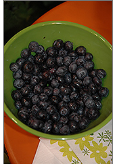
Peach Sorbet Blueberry fruit

This shrub is quite ornamental as well as edible, and is as much at home in a landscape or flower garden as it is in a designated edibles garden. It does best in full sun to partial shade. It does best in average to evenly moist conditions, but will not tolerate standing water. It is very fussy about its soil conditions and must have sandy, acidic soils to ensure success, and is subject to chlorosis (yellowing) of the foliage in alkaline soils. It is quite intolerant of urban pollution, therefore inner city or urban streetside plantings are best avoided, and will benefit from being planted in a relatively sheltered location. Consider applying a thick mulch around the root zone in winter to protect it in exposed locations or colder microclimates. This particular variety is an interspecific hybrid.