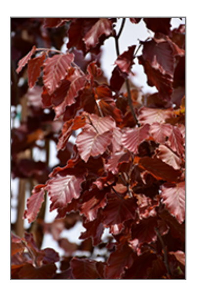
Red Obelisk Beech foliage