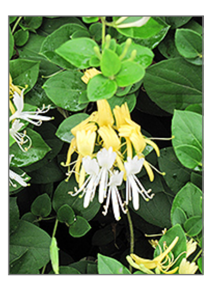
Hall's Japanese Honeysuckle flowers