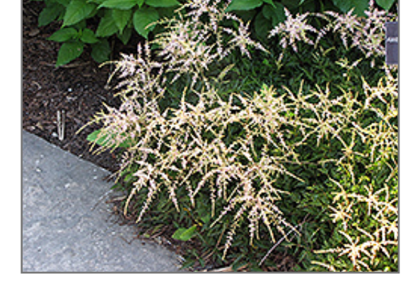
Sprite Astilbe in bloom