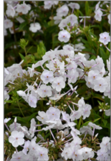
Fashionably Early Crystal Garden Phlox flowers