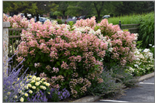
Quick Fire Hydrangea in bloom