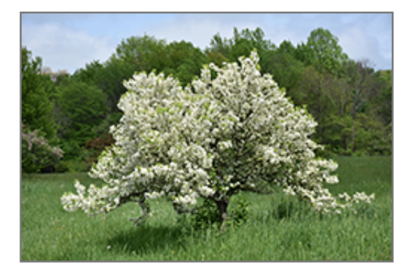
Lollipop Flowering Crab in bloom

This is a high maintenance shrub that will require regular care and upkeep, and is best pruned in late winter once the threat of extreme cold has passed. Gardeners should be aware of the following characteristic(s) that may warrant special consideration;