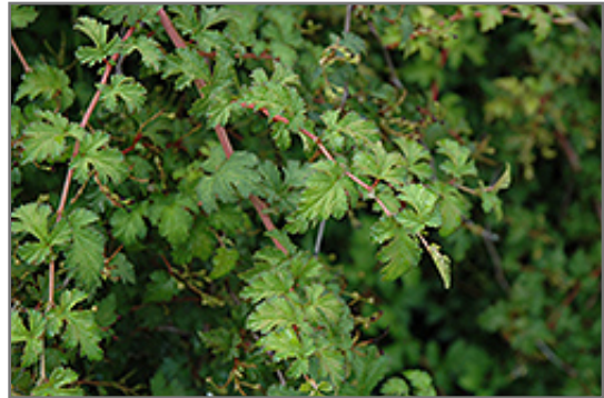
Cutleaf Stephanandra foliage