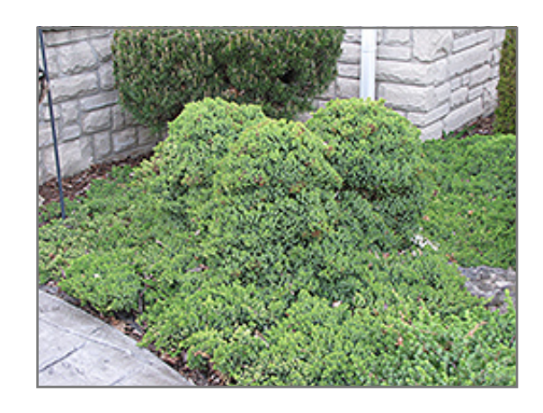
Dwarf Japanese Garden Juniper

Dwarf Japanese Garden Juniper is a dense multi-stemmed evergreen shrub with a ground-hugging habit of growth. It lends an extremely fine and delicate texture to the landscape composition which should be used to full effect.