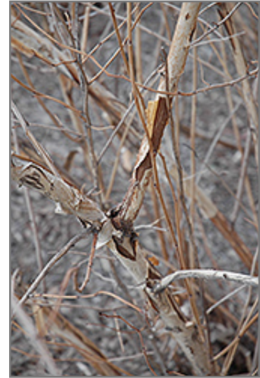
Diablo Ninebark bark

This shrub does best in full sun to partial shade. It is very adaptable to both dry and moist locations, and should do just fine under average home landscape conditions. It is not particular as to soil type or pH. It is highly tolerant of urban pollution and will even thrive in inner city environments. This is a selection of a native North American species.