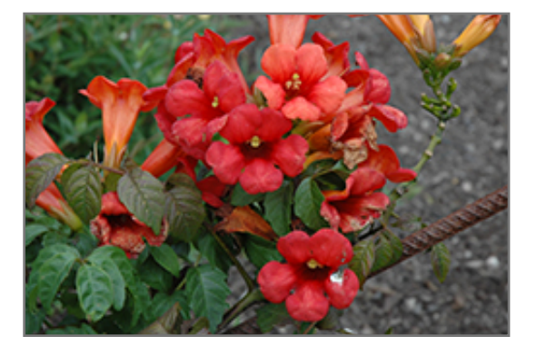
Summer Jazz Fire Trumpetvine flowers

810 N. Indiana Ave. Crown Point, IN (219) 663.1042