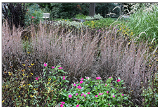
Standing Ovation Bluestem in fall

Standing Ovation Bluestem is recommended for the following landscape applications;