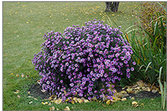
Purple Dome Aster in bloom