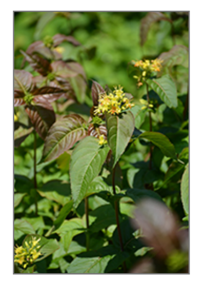
Kodiak Black Diervilla flowers