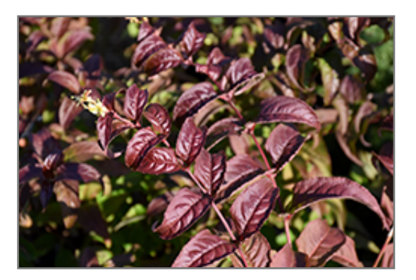
Kodiak Black Diervilla foliage

Kodiak Black Diervilla will grow to be about 4 feet tall at maturity, with a spread of 4 feet. It tends to fill out right to the ground and therefore doesn't necessarily require facer plants in front. It grows at a medium rate, and under ideal conditions can be expected to live for approximately 20 years.