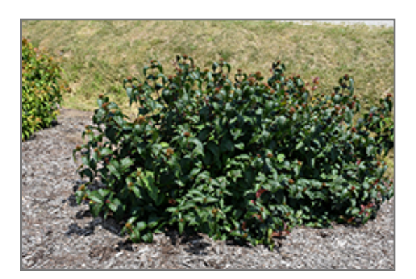
Kodiak Black Diervilla

This shrub will require occasional maintenance and upkeep, and is best pruned in late winter once the threat of extreme cold has passed. It is a good choice for attracting butterflies and hummingbirds to your yard. Gardeners should be aware of the following characteristic(s) that may warrant special consideration;