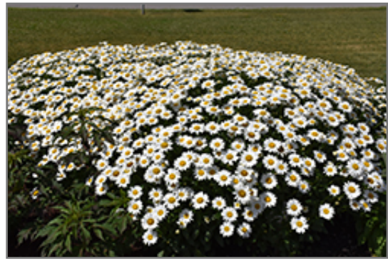
Becky Shasta Daisy in bloom