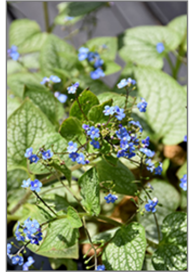
Jack of Diamonds Bugloss flowers

Jack of Diamonds Bugloss is recommended for the following landscape applications;