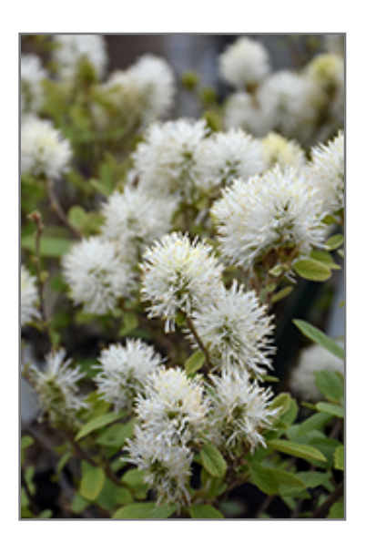
Legend Of The Small Fothergilla flowers