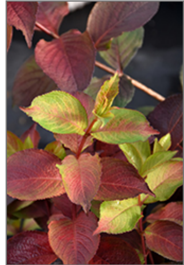
Midnight Sun Reblooming Weigela foliage