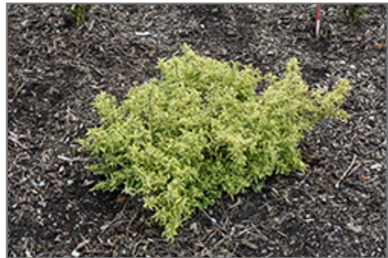
Bubbly Wine Weigela