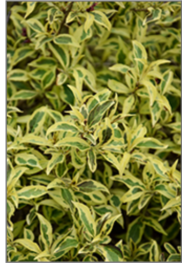
Bubbly Wine Weigela foliage

Bubbly Wine Weigela is recommended for the following landscape applications;