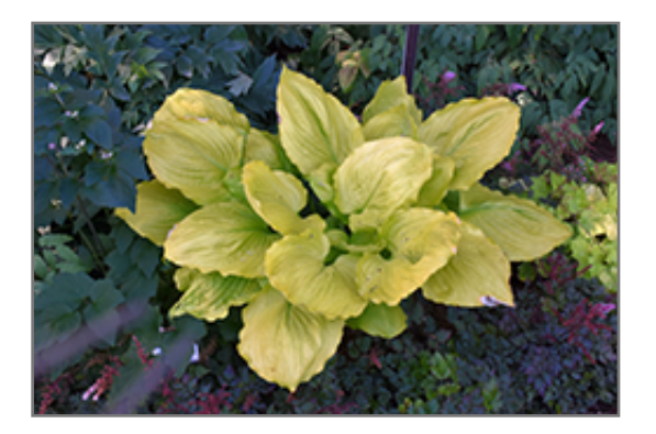
Seasons in the Sun Hosta

810 N. Indiana Ave. Crown Point, IN (219) 663.1042