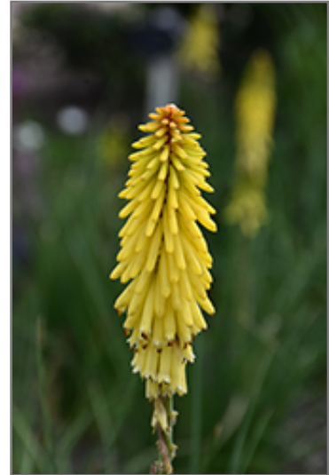
Glow Stick Torchlily flowers

Glow Stick Torchlily is recommended for the following landscape applications;