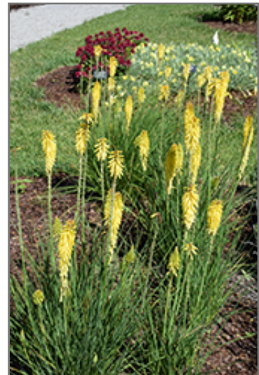
Glow Stick Torchlily in bloom