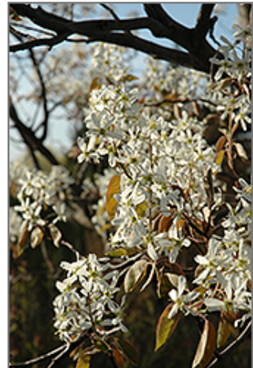
Cumulus Serviceberry flowers