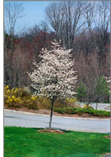
Cumulus Serviceberry in bloom