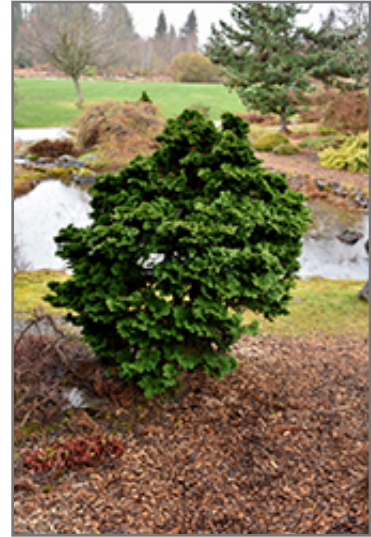
Dwarf Hinoki Falsecypress