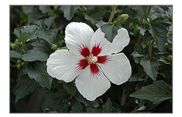
Lil' Kim Rose of Sharon flowers

810 N. Indiana Ave. Crown Point, IN (219) 663.1042