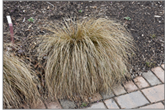
Prairie Fire Sedge

Prairie Fire Sedge is recommended for the following landscape applications;